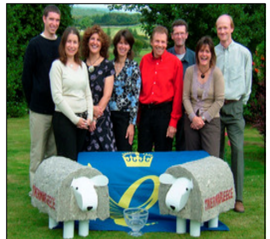
The Second Nature UK Team in 2004 celebrating achieving The Queen's Award for Enterprise

The experience and knowledge of breathable building techniques is enabling the Company to expand to create a range of sustainable building insulation solutions.