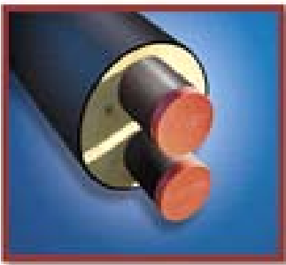
Twin Steel Pipe