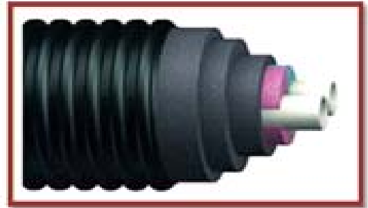
Twin Plastic Pipe

Other issues that need considering are the insulation thickness around the pipes and the size of the trench needed to bury the pipes, which can affect construction costs.