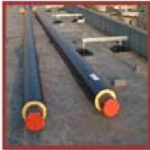
Single Steel Pipe