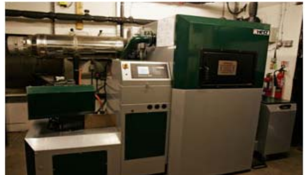
BioMatic 250KW boiler

Visit case studies like this during the annual Cumbria Green Build Festival .