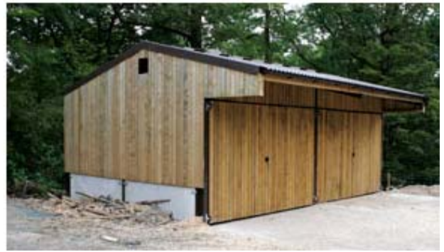
Wood chip storage building