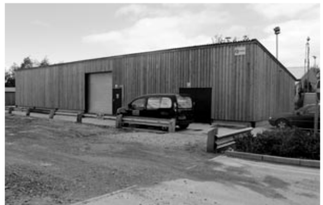
Biomass Energy Centre Building and fuel store