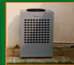
Air Source Heat Pump

energy efficiency • insulation • wind • hydro wood burners • PV panels • heat pumps waste water • new build ecohouses traditional building refurbishments