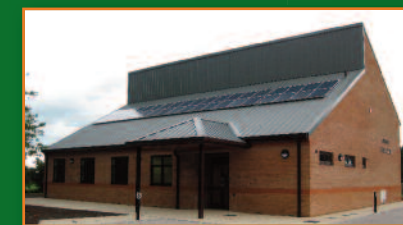
Thursby Parish Hall, Thursby