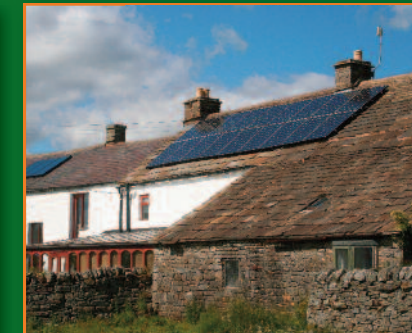
High Ashgill, Garrigill