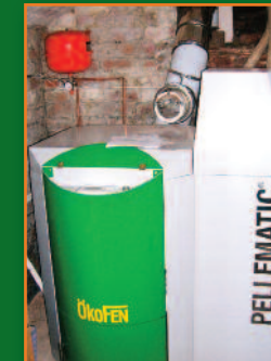
Wood Burning Boiler